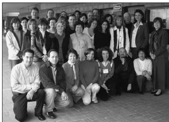
Thirty-four participants completed the week-long MHF curriculum at the Universidad Ibero Americana and received their MHF certification. The class consisted of people from across Mexico in various professions and careers.

The next MHF instructor training program will take place in Penang, Malaysia at the Universiti Sains Malaysia (USM). NBCC-I has contracted to maintain and administer the MHF program in Malaysia.